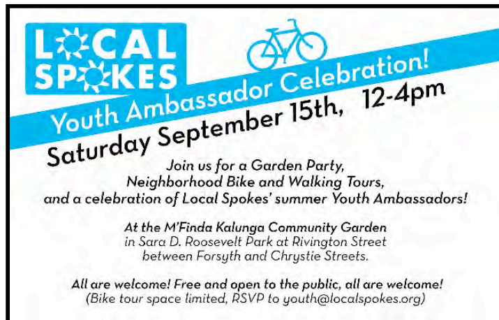
(Youth Ambassador Celebration Invitation)

What: Getting the word out helps a much wider audience learn about your mission and activities (even if they don't all show up at the event!)