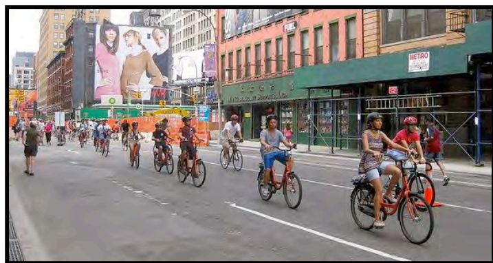
(YA Bike Tour)

If a group bike ride is part of the event, plan the route by actually riding it in advance. Consider the skill level of the rider and always plan for a person to ‘sweep’ to ride at the end and collect stragglers, or fix a flat. Youth Ambassadors can design the route, too!