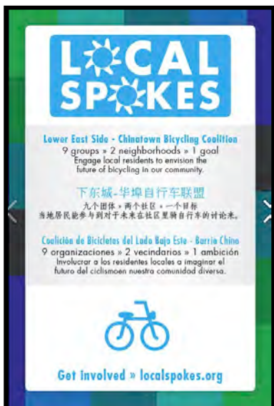
(Ex: A Local Spoke Promotional Postcard)