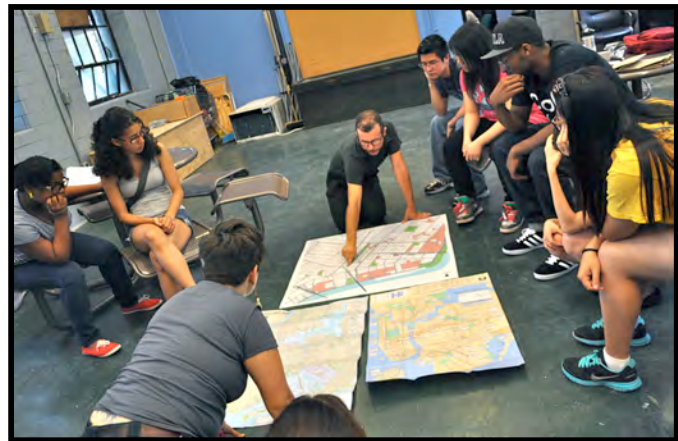
(Youth Ambassador Planning Session)

A youth mentor was responsible for writing about the experience of the group throughout the summer of 2012. The youth documented lessons, places visited, and general impressions. All participants kept a journal for their own thoughts and drawings, too.