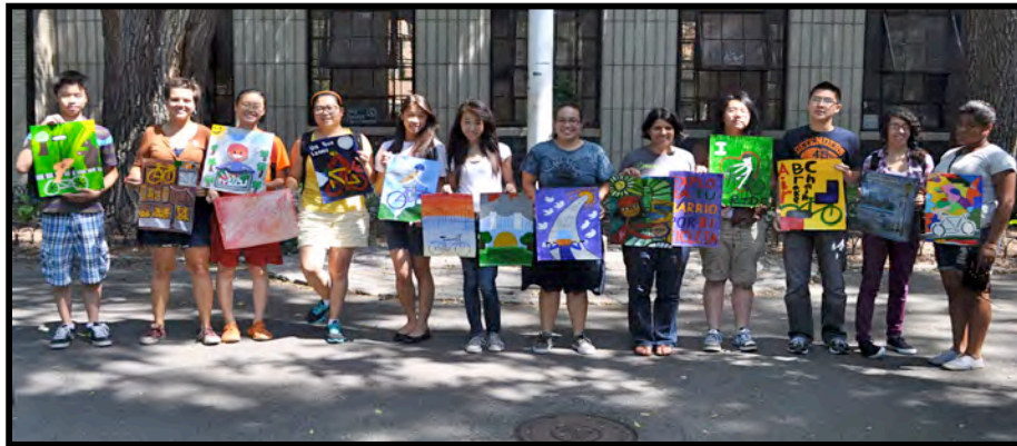
Youth Ambassadors 2012