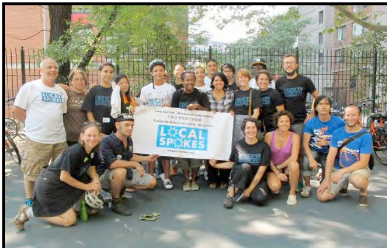
Coalition Committee Members

With so many tasks done by committee, this provides continuity and guide future decision-making and implementation.